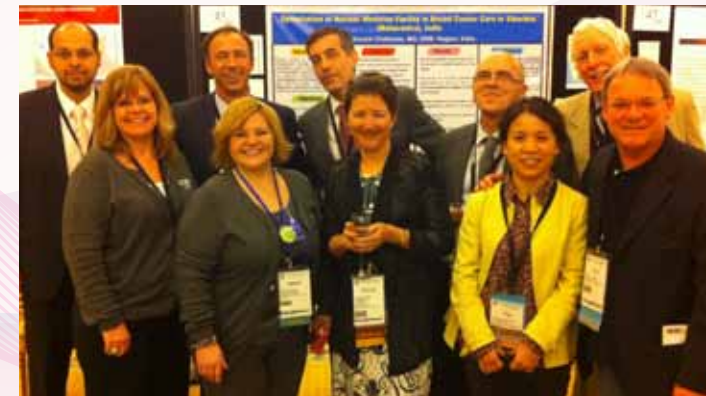
2014 International Delegates

Attending the Annual NCBC Breast Cancer Conference provides the International Delegates with an excellent educational opportunity.