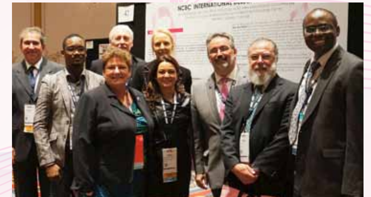
2015 International Delegates

The NCBC International Liaison Committee has been mandated to ensure that ALL donated funds are both exclusively and cost-consciously used to cover the Program’s travel and room & board expenses. Thus the average cost of the combined Conference/Mini-Fellowship per Delegate is only $7.5 K per designated Delegate, a small amount when considering the immediate impact on improving breast care in these countries. The Program is also collecting funds for specific imaging and diagnostic technologies that can be of great importance for Delegates to provide best care.